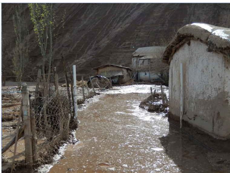
Affected household in Shuroobod. Photo by REACT RRT, April 2014