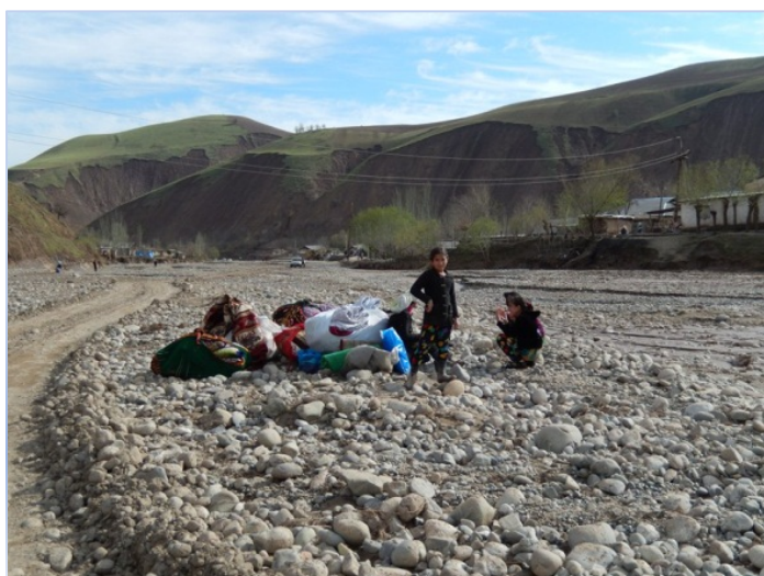
Displaced family in Shurobod. Photo by REACT RRT, April 2014

National Commission of Emergency Situations is establishing final assessments of needs. According to preliminary information up to date, the below priorities have been identified: