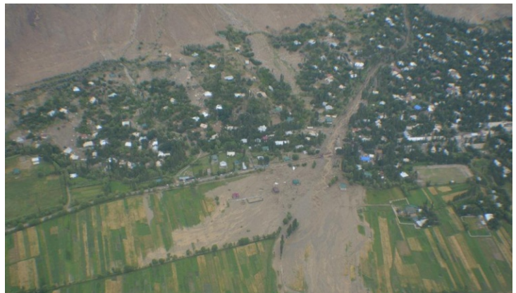
Mudflow in Barushon village, Rushan District, GBAO, July 21, 2015

As CoES reports, the water level increased in Bartang river at 42,47,56,58,81,85,109,117 km of Rushan – Bartang highway. Moreover a mudflow occurred in Bartang and Barushan Jamoats which affected a number of households. Based on preliminary information five houses severely and five more partially damaged in Bardara village. The road is blocked in Bartang Jamoat (Khijez, Sipunj, Razuj, Ajirkh, Chadud, Yapshorv, Ghudara villages) and the population is in isolation at the moment (please see the map). Six houses destroyed and nine houses partially damaged in addition damage was done to agricultural land in Barushan Jamoat.