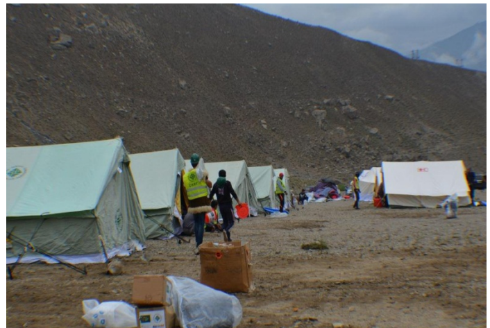
Tent camp for affected households in Shugnan District, GBAO, July 19, 2015

The President of the country has assigned relevant government agencies to coordinate relief and response operations in the areas affected by mudflow and surrounding districts. Local authorities have allocated land for construction of the houses for 83 affected families in Shugnan District. The construction of new houses for around 70 households has already started and laying of water pipe from the channel to the camp is ongoing. However, people at the affected site, whose houses were not affected and who was not evacuated (in Barsem and Berdibekobod villages), do not have access to drinking water and currently rely on drinking water that the volunteers from the communities are bringing.