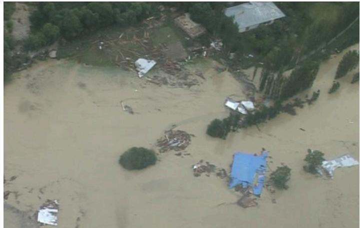
Flood affected area in Shugnan District, GBAO, July 19, 2015

Water level in the artificial lake, occurred following the glacier melting and flow of mud coming from the mountains, in Kolkhozobod village (Suchan Jamoat), has increased 20cm. Based on information received from Committee of Emergency Situations (CoES) total number of affected households stands at 81. Out of this, at least 70 have been considered as completely destroyed and 16 more are partially damaged. As the water flowing from the valley erodes the land and destroys more houses over time the number of the damaged houses is continuously growing. Joint commission of Main Department of Geology, CoES, FOCUS