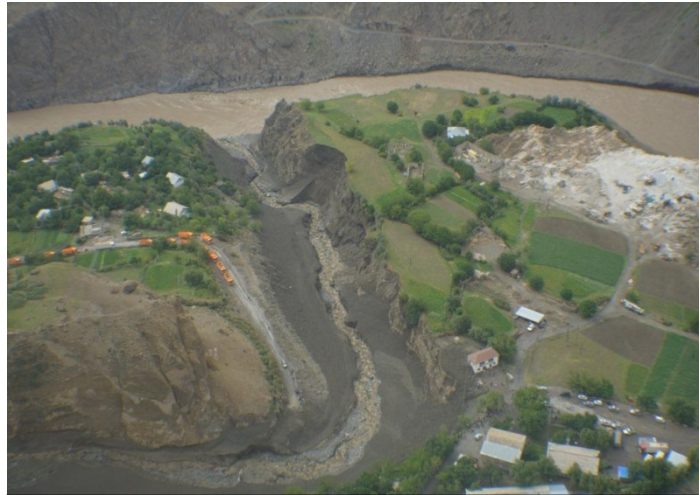
Mudflow in Lugad village, Vanj District, GBAO, July 21, 2015

The communities have no electricity since the disaster occurred. A group of volunteers (local residents) set up a temporary response team to clean the road from debris, as well as monitor and respond to possible disasters.